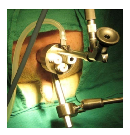
Figure 1 Transanal endoscopic microsurgeryplatform.

rectal cancer. Robotic assisted surgery was introduced to address the limitations of laparoscopy, and gained acceptance from the improved visualization, lower conversion rates, better TME quality lower positive CRM rate, and earlier recovery of genitourinary functions<sup>[32-34]</sup>. Studies reported equivalent oncologic and functional outcomes of both approaches, which raise the issue about the cost-effectiveness of the robotic platform, and the need for more effective and cost-efficient platforms<sup>[35-37]</sup>.