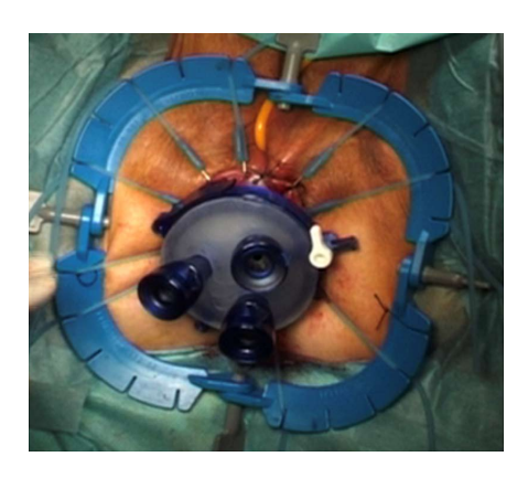
Figure 4 Transanal access platform with trocar insertion in an inverted triangle shape.

mobilized, and the dissection continued proximally in the avascular TME plane towards the peritoneal reflection to meet the abdominal mobilization (Figure 5)<sup>[82,92]</sup>. The extraction can be performed transanally, or though a Pfannenstiel or stoma-site incision, depending on the abdominal approach used and the bulk of the specimen.