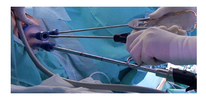
Figure 2 Transanal minimally invasive surgery platform.

T2 and more advanced rectal tumors<sup>[55,59-62]</sup>. TEM and TAMIS remain important in the evolution of the TaTME platform.